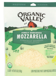
Organic Valley Organic Shredded Cheese selected varieties