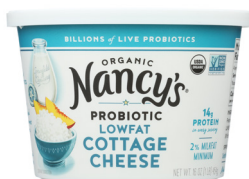
Nancy's Organic Cottage Cheese selected varieties