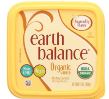
Earth Balance Organic Vegan Whipped Buttery Spread