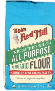
Bob's Red Mill Organic Flour selected varieties