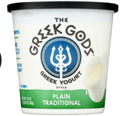
The Greek Gods Greek Style Yogurt selected varieties