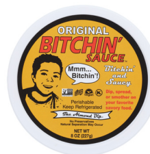
Bitchin' Sauce Original Bitchin' Sauce selected varieties