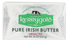
Kerrygold Butter selected varieties