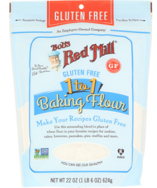
Bob's Red Mill 1 to 1 Baking Flour