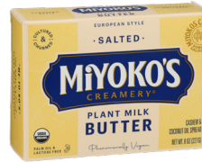
Miyoko's Organic Cultured Vegan Butter selected varieties