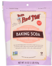
Bob's Red Mill Baking Soda

Homemade for the holidays. Celebrate better with Bob's Red Mill baking ingredients.