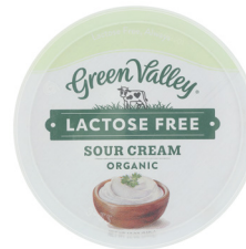
Green Valley Creamery Organic Lactose Free Sour Cream