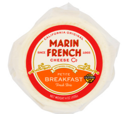
Marin French Cheese Co. Brie selected varieties